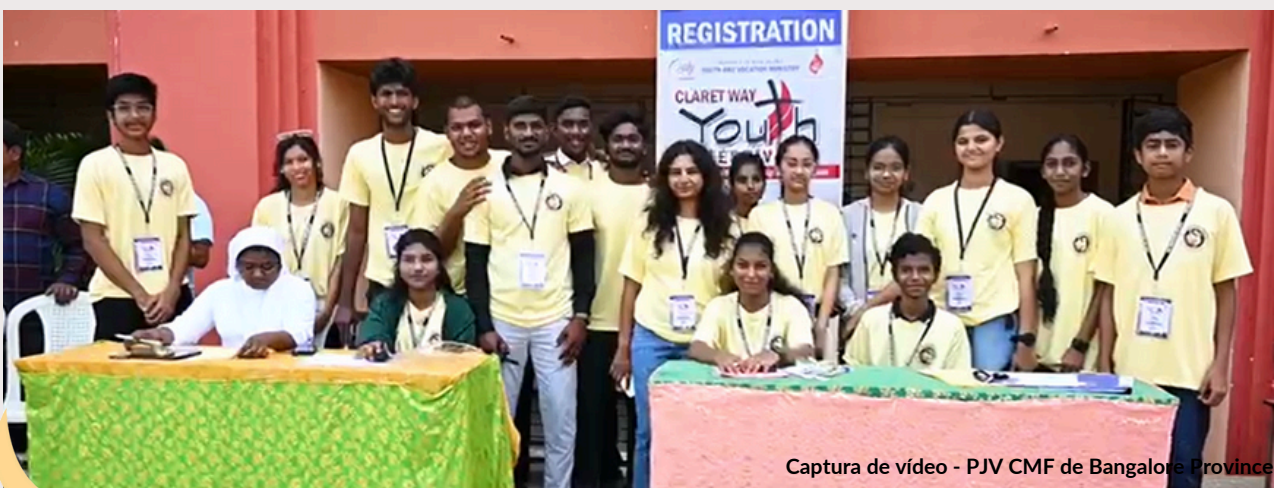
Captura de vídeo - PJV CMF de Bangalore Province