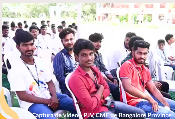
Captura de vídeo - PJV, CMF de Bangalore Province

positive change and that true leadership lies in serving others.