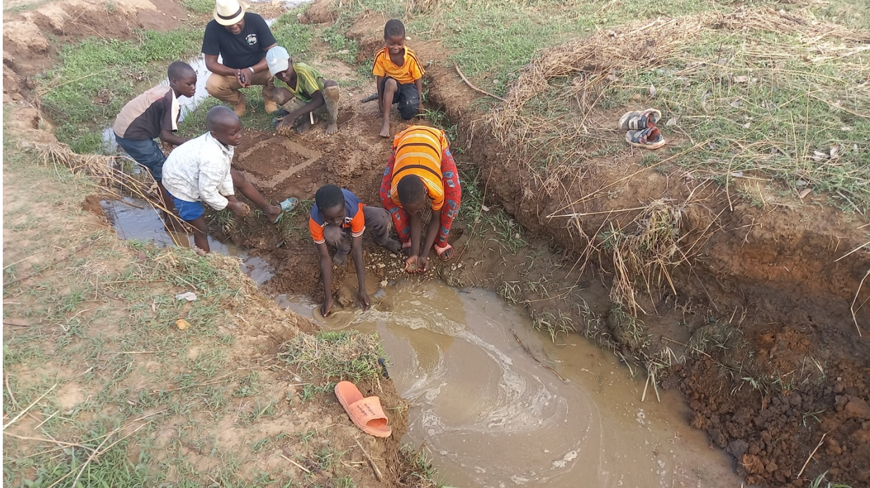
Claret Vida Picture 3: The source of life????

In the villages in our parish territory that attracted our curiosity since our arrival in this almost forgotten part of Cameroon, water is so scarce. If during the rainy season, which lasts only 3 to 4 months in the year, the population can collect water as it can, in the dry season it becomes very scarce and undrinkable. Many diseases are observed in this area because of the consumption of river and lake water. This explains our motivation to direct our very first project towards the realization of boreholes and overhead water tanks to thus contribute to relieve the social pain of the people.