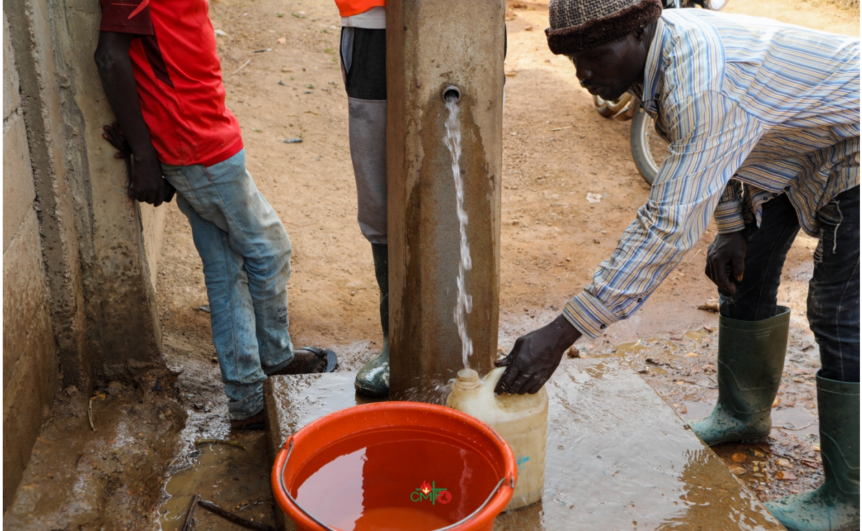
Claret Vida Picture 6: This is Clean Water