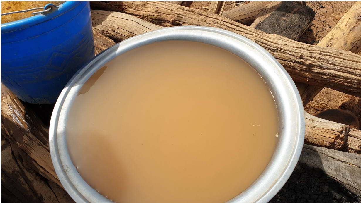
Claret Vida Picture 2: This is not TEA; this is water