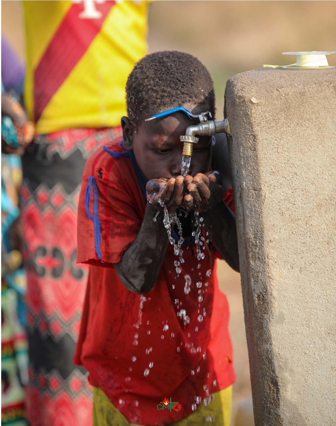
Claret Vida Picture 1: Drinking from the Fountain of Life

WATER IS LIFE, WATER IS EVERYTHING, WATER SETS US FREE