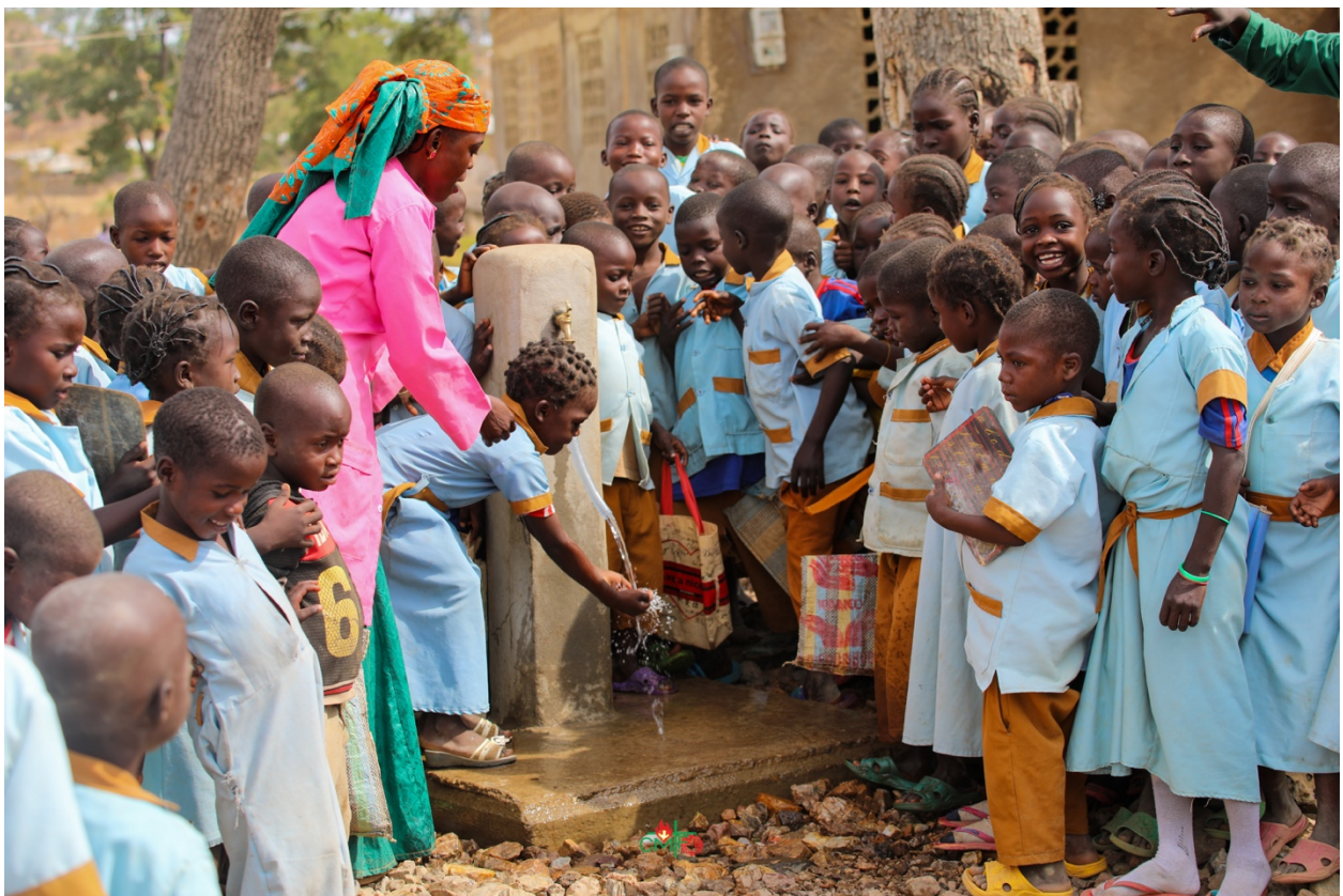
Claret Vida Picture 7: Water is Education