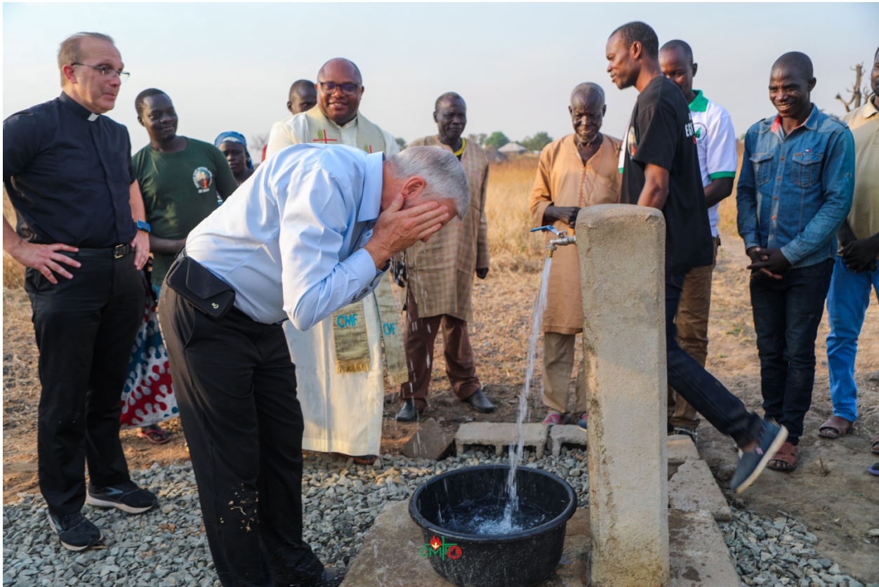
Claret Vida Picture 8: Water is Emancipation