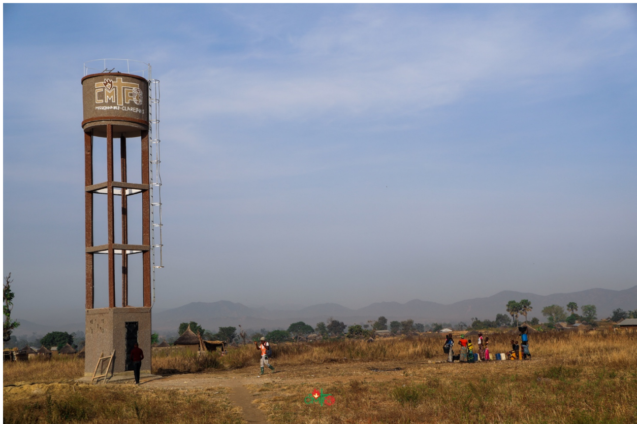
Claret Vida Picture 4: This is a sample of Water wells constructed in different villages.