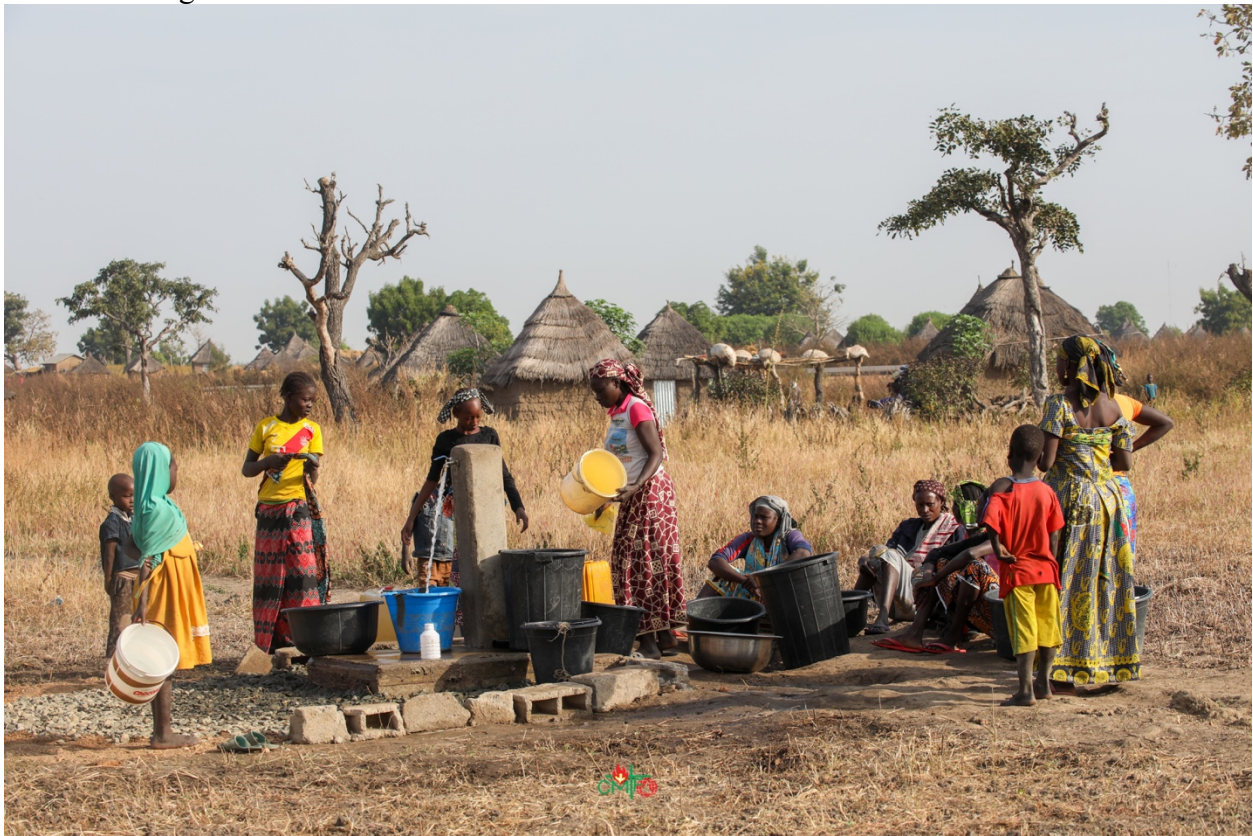
Claret Vida Picture 5: Water is Fraternity

□ E - EDUCATION wise, Clean Water helps keep kids in school, especially girls. Less time collecting Water means more time in class. `