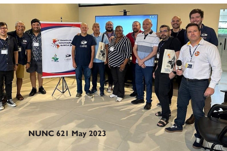
NUNC 621 May 2023